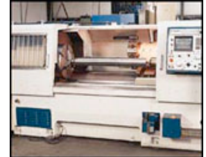
Mori-Seiki TL5 Turning Center