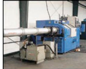
Mazak 15N Turning Center with Bar Feed

Sematco offers machining flexibility combined with quality production capability. Our CNC turning centers range up to 24 inch swing, some with automatic bar feed and with live tooling.