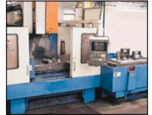
Mazak V515/40 Vertical Machining Center

Vertical CNC machining centers are an integral part of our production strategy. Our verticals are equipped with two pallets suitable for production runs and machining to close tolerances.